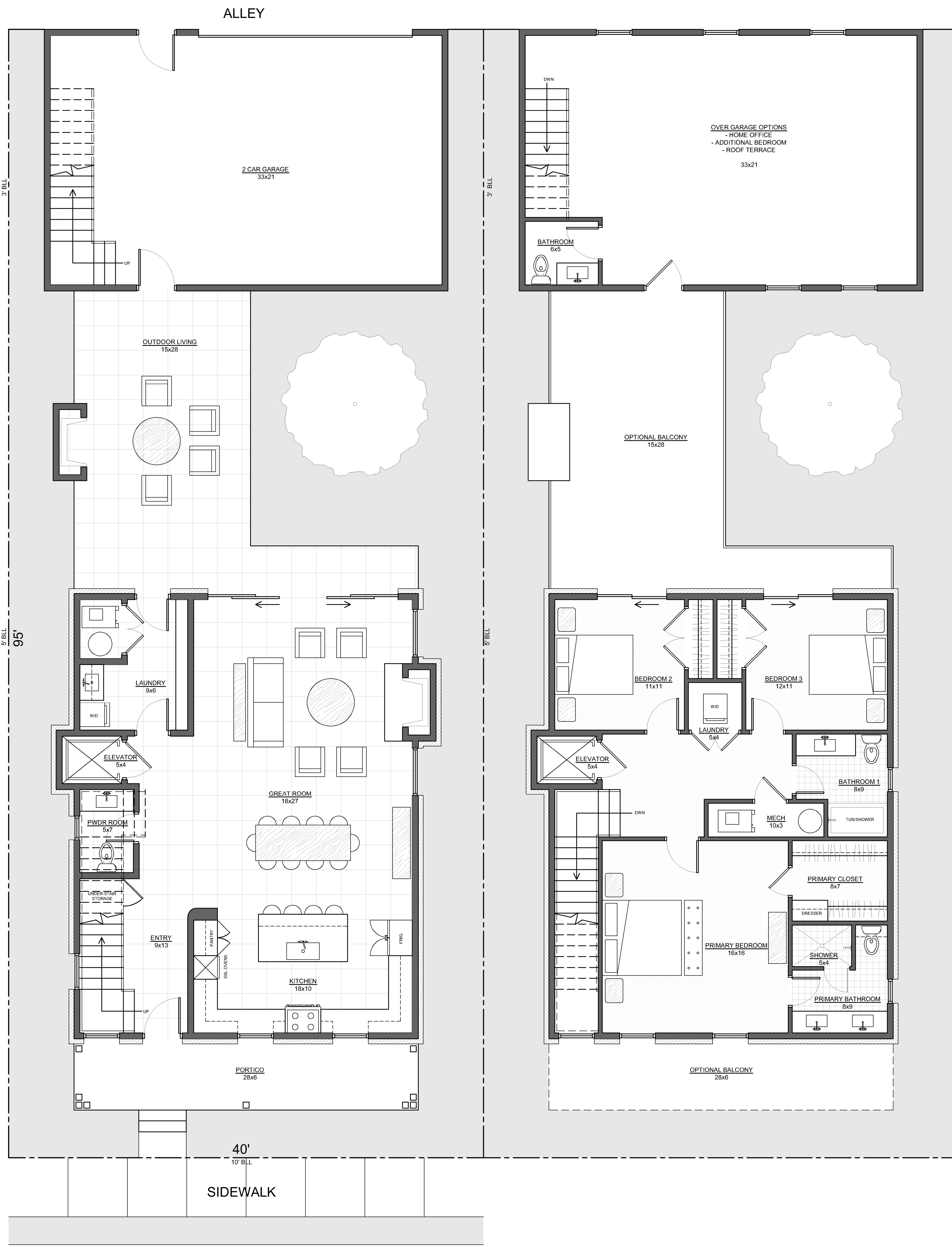
1ST FLOOR 1,105 SQFT